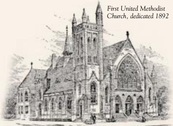
First United Methodist Church, dedicated 1892