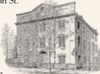
First Methodist Episcopal Church, 1842-1892

1842: Dedicated second house of worship, southwest corner of Duke St. and Walnut St.